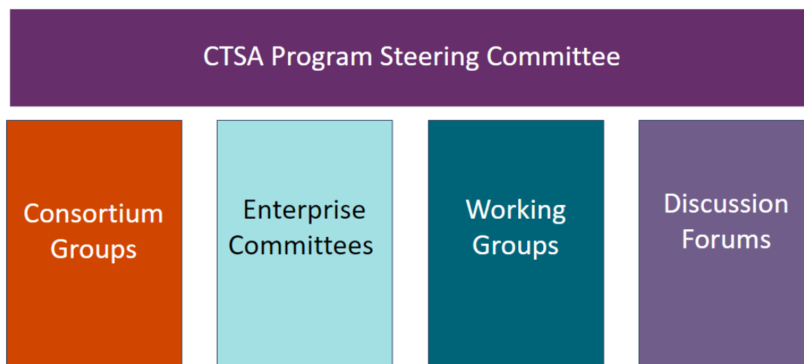
Figure 1: Overview of the CTSA Program Groups